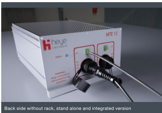
Back side without rack, stand alone and integrated version