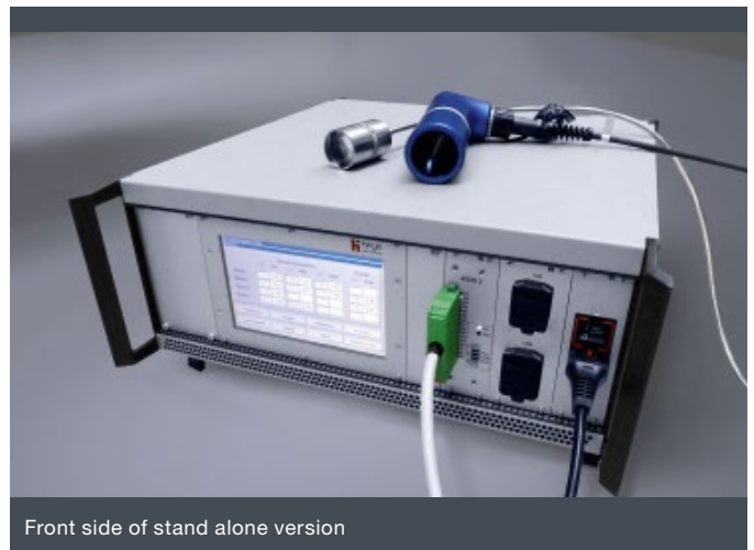
Front side of stand alone version