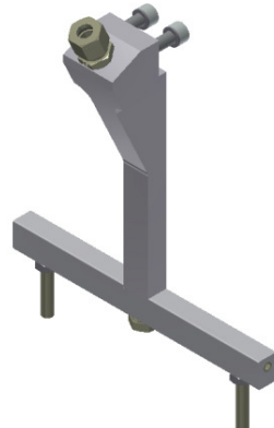
Additional Cooling DG