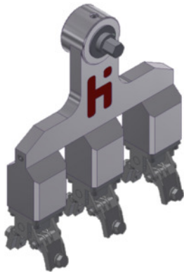
Tong head TG